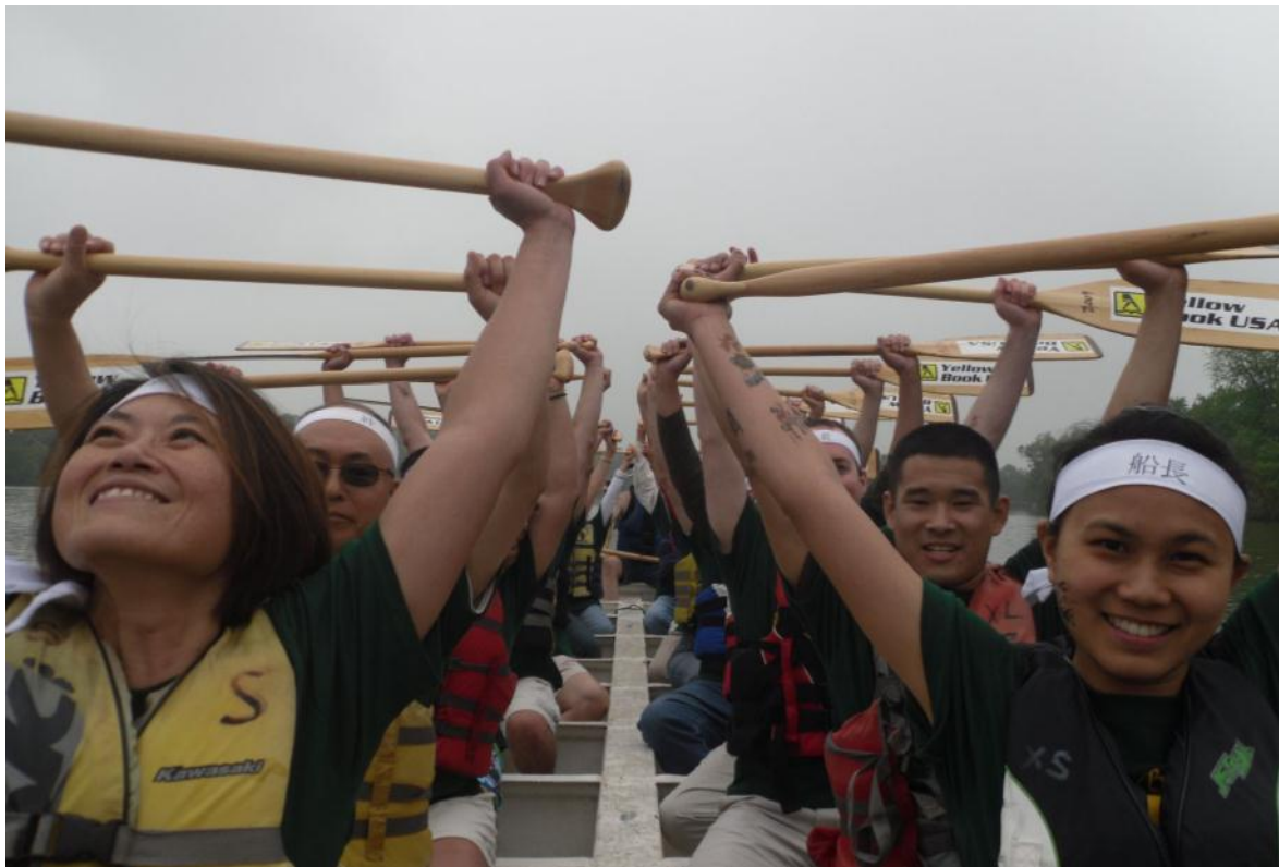
The Boating Bodhisattvas in Dragon Boat Race 2011.

In addition to our English newsletter, the Chicago Chapter publishes a monthly newsletter in Chinese. Both the English and Chinese newsletters are archived in the newsletters section of the DDMBA Chicago website.